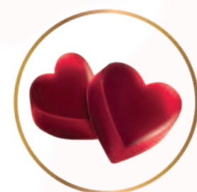
Delicious pectin gummy form!

Usage Recommendation: The recommended daily use dosage is 2 chewable gel forms everyday for adults 11 years and older.